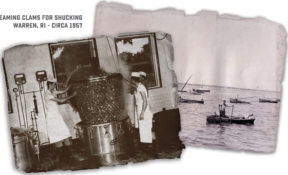
HARVESTING CLAMS ON WARREN'S WATERFRONT WARREN, RI - CIRCA 1957